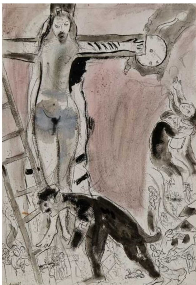
Marc Chagall, Apocalypse en lilas, Capriccio, 1944-47 .

The event, which took place on Zoom, was also recorded, and is available now on the Parkes Institute's YouTube page.